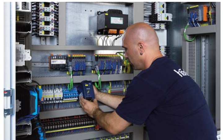
Control panel construction

Another important issue of project-specific adjustment is detailed software configuring by our experienced engineers.