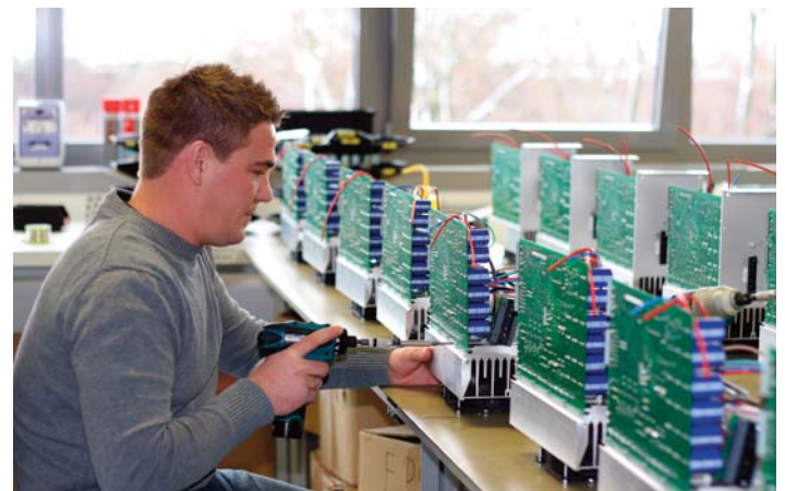
Manufacturing of electronic power supplies

Our UV lamps are supplied and controlled with electronic power supplies (EPS) made by Höhle. The use of high quality components and precise processing ensure a long service life.