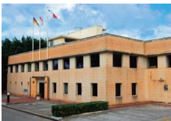
Raesch Quarz (Malta) Ltd, 3.500 sqm