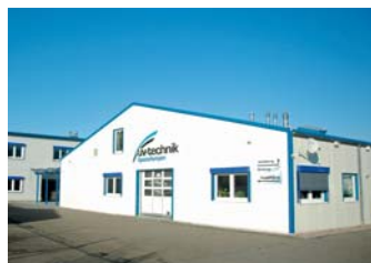
UV-Technik Speziallampen GmbH, 1.500 sqm