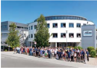
Dr. Höhle AG, production area: 4.500 sqm