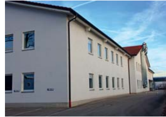
Aladin, 1.500 sqm