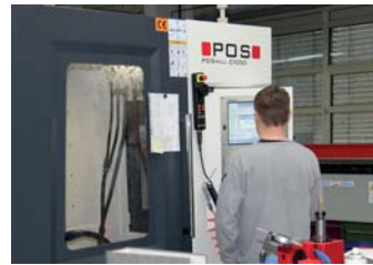
Milling of work pieces

For precise manufacturing we rely on ultra-modern machinery such as CNC lathes and milling machines.