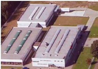
Eltosch Grafix, 4.500 sqm