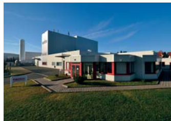
Raesch Quarz GmbH, 2.100 sqm