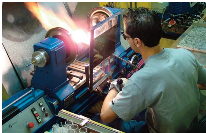
UV lamp production

Also important is the high quality of the reflectors - designed and coated by Hönle. Therefore we are equipped with an own system for coating glass and aluminum reflectors.