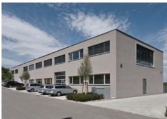
PrintConcept, 1.500 sqm