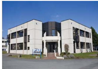
Panacol Elosol GmbH, 500 sqm