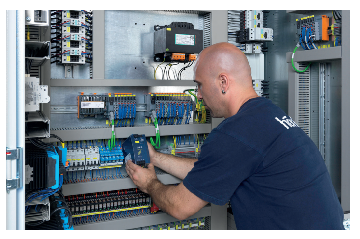
Control panel construction

Another important issue of project-specific adjustment is detailed software configuring by our experienced engineers.