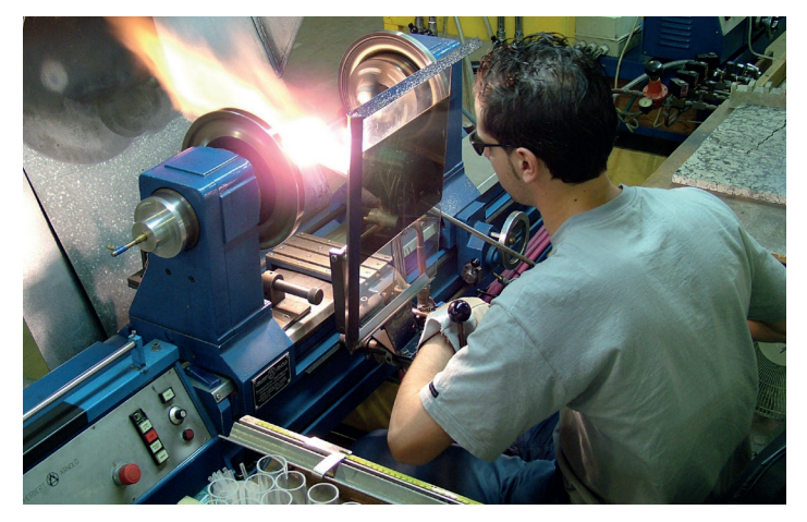
UV lamp production

Also important is the high quality of the reflectors - designed and coated by Hönle. Therefore we are equipped with an own system for coating glass and aluminum reflectors.