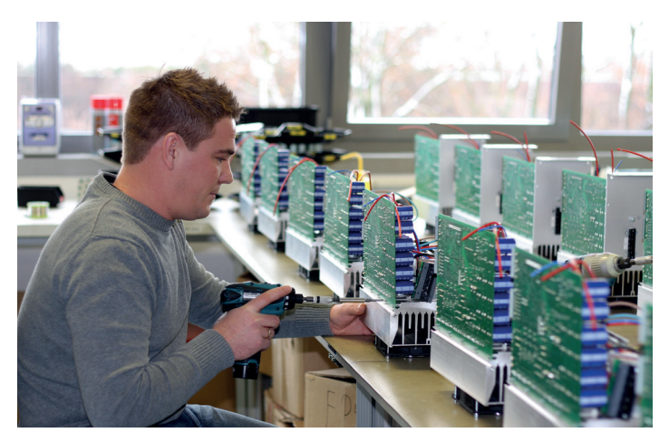
Manufacturing of electronic power supplies

Our UV lamps are supplied and controlled with electronic power supplies (EPS) made by Hönle. The use of high quality components and precise processing ensure a long service life.